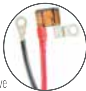
Positive and Negative connections for battery power supply